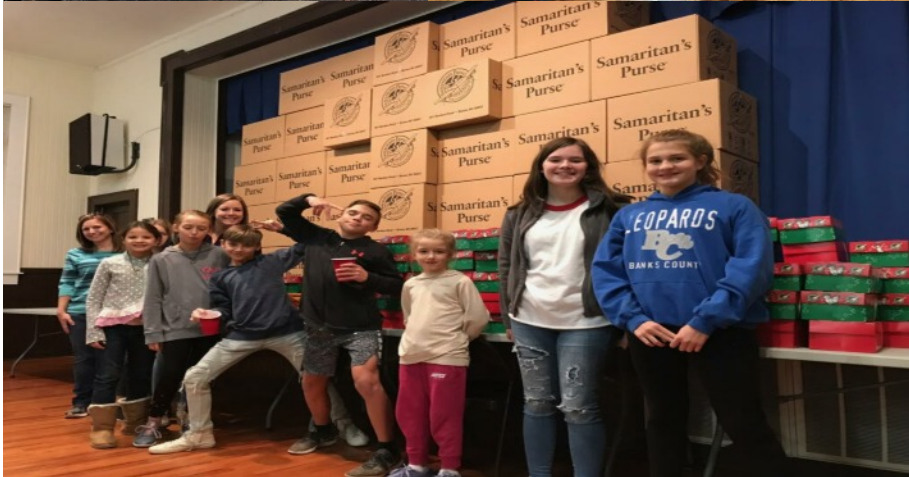
Youth delivering Operation Christmas Child 100 SHOE BOXES!