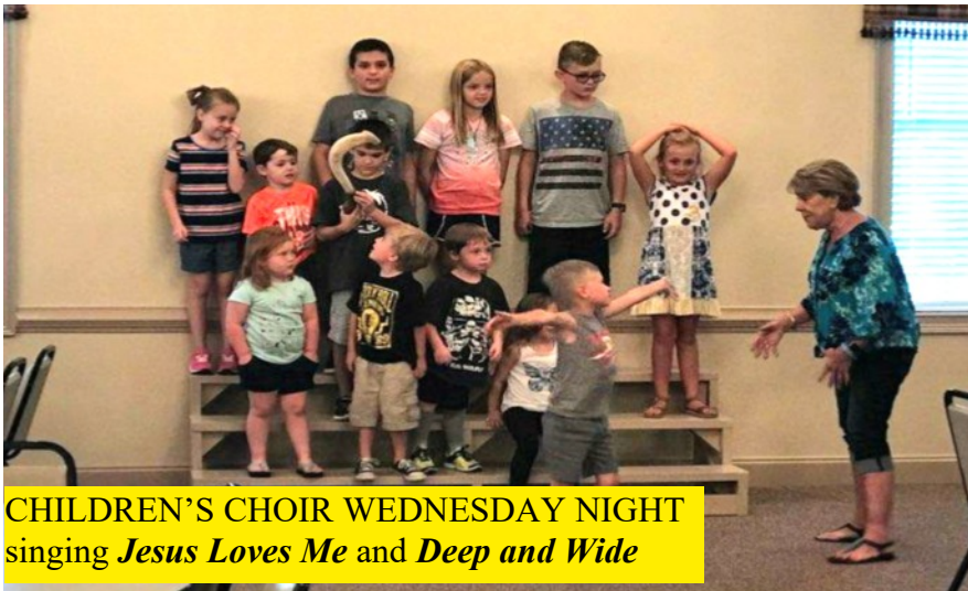
CHILDREN'S CHOIR WEDNESDAY NIGHT singing Jesus Loves Me and Deep and Wide