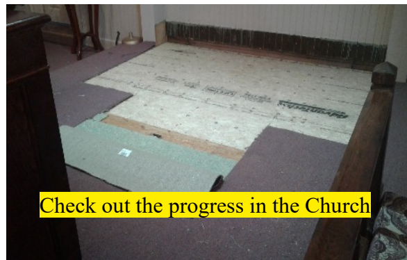
Check out the progress in the Church

Please contact Jon Chambers if interested, chambers5@windstream.net or (678)234-2362