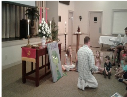
Who could forget the disgusting Goody Louie at Altar Adventures