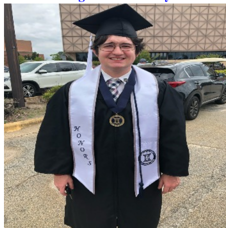
Houlton Boomer Honor Graduate from Augusta University