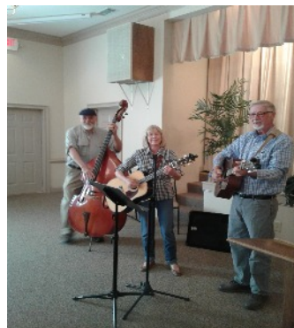
Praise & Worship Service Coming this July with Three Chords and a Prayer!