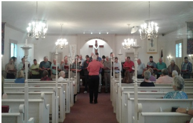
OUR HOMER UMC MEN SANG SUNDAY FOR MOTHER'S DAY! THEY WERE WONDERFUL!