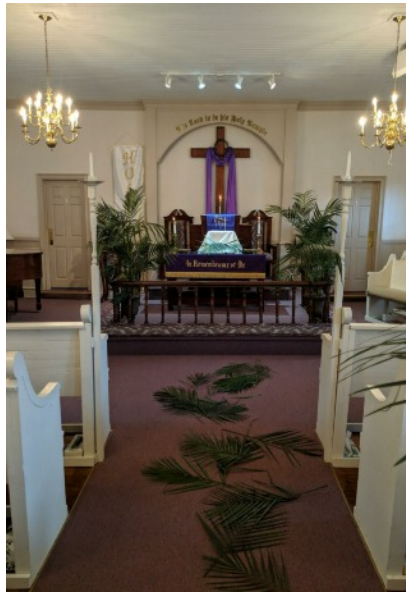
PALM SUNDAY PICTURES