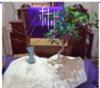
Altar this Sunday

Remember to send any news or pictures for the bulletin to homermethodist@gmail.com. Deadline is Monday at 6pm.