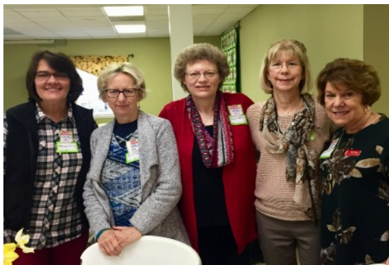
UMW Lenten Day Apart Attendees

Email the church at homermethodist@gmail.com