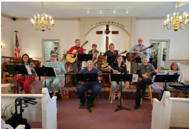
Many thanks to Three Chords & A Prayer and New Instruments for playing for Worship Sunday and also for SON on Saturday! Great music!!

Grab an instrument and join us Wednesdays.