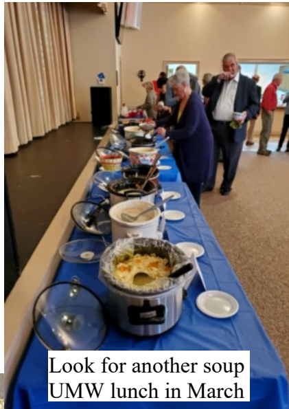
Look for another soup UMW lunch in March