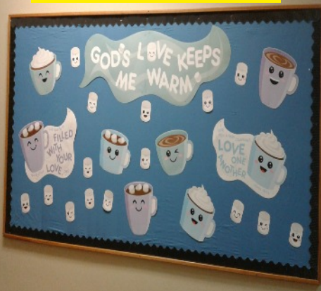
Children's Bulletin Board