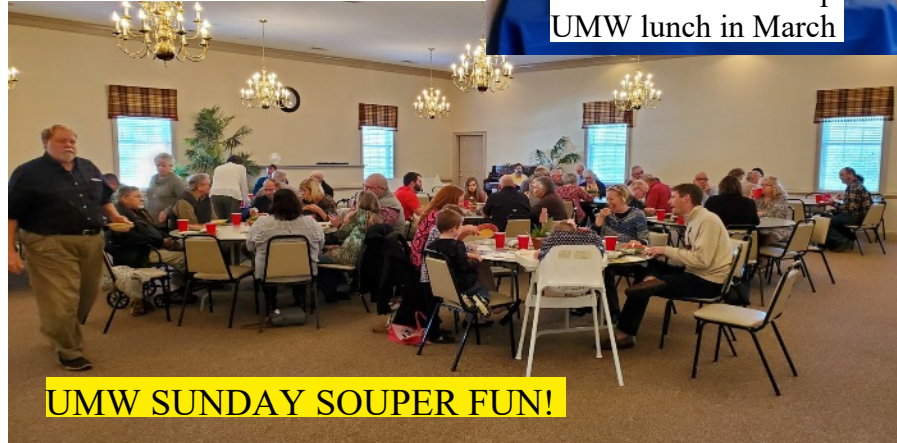
UMW SUNDAY SOUPER FUN!