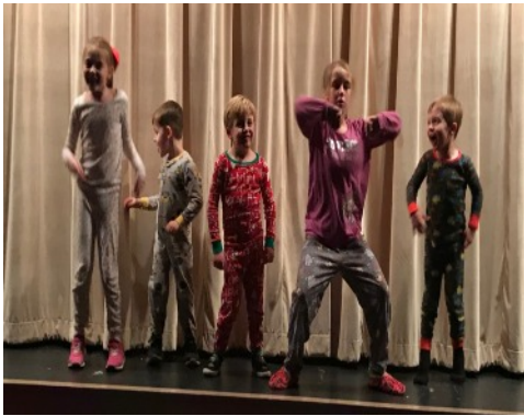
FRIDAY NIGHT FUN!